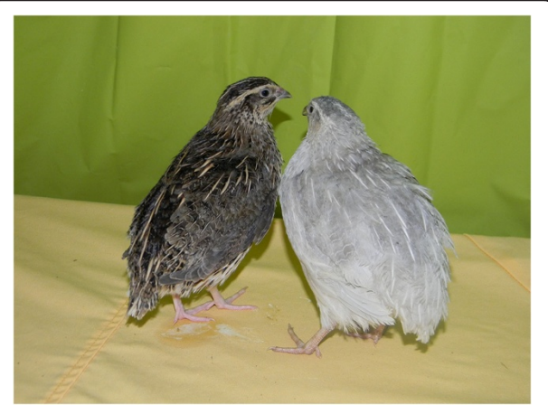
Figure 1 Wild-type (left) and lavender (right) Japanese quail.

All Japanese quail were produced and maintained at the INRA Experimental Unit PEAT in Nouzilly, France (Pôle d'Expérimentation Avicole de Tours, F-37380 Nouzilly, authorization B37-175-1, 2007) in accordance with European Union Guidelines for animal care, under authorization 37–002 delivered to D. Gourichon by the French Ministry of Agriculture. Animal procedures were