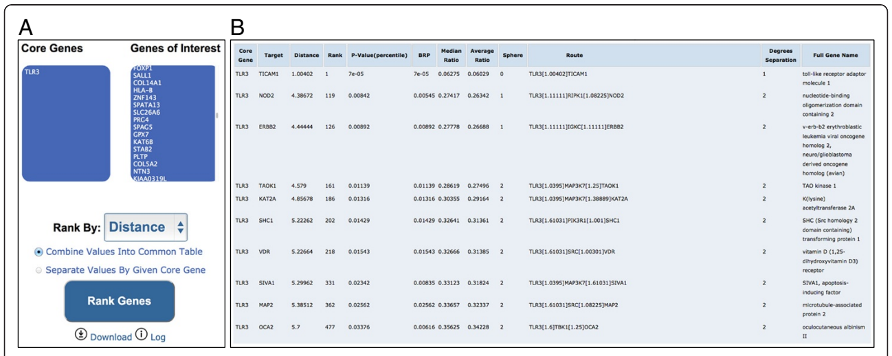
Figure 2 The HGCS interface. (A) The two boxes contain the list of genes to prioritize/analyze (which can be acquired from any high-throughput experiment after the application of filters; alternatively, any user-defined list of candidate genes can be used), and the core genes (known to be associated with the phenotype) for ranking purposes. A scroll box allows a choice of metrics for ranking (distance, p -value, or best reciprocal p -value), and the user may choose whether to rank the results globally, or separately by core gene. (B) The output consists of a table of genes ranked with respect to the core genes, which can be downloaded as a tab-separated text file. The information about the nature of connectivity between the core and target genes provided includes HGC-predicted biological distance, ranking of the target gene in the connectome of the core gene, the ratio between biological distance and the genome-wide median and mean biological distances to the core gene, the sphere of the target gene around the core gene, degrees of separation between the genes, and the full gene name.