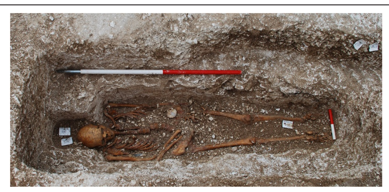
Figure 1 The burial of Sk27 showing the associated scallop shell.

Sanger sequencing of targeted SNPs (Table 2) was in agreement with Illumina sequencing so validating both typing and sequencing methods. Analysis of VNTR genotypes was not possible for either Sk14 or Sk27 as insufficient numbers of reads spanned the ML0058c (21–3) region,