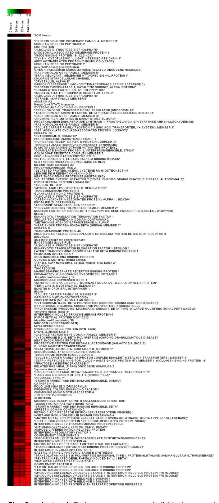
Figure 2 Expression profiles for cluster 1. Each row represents an individual gene, and each column a post-infection time point. Red coloration indicates increased expression of a gene relative to uninfected animals, and green indicates decreased expression. Genes (Cluster 1, n = 158) identified to be significantly up-regulated in response to ATV infection.