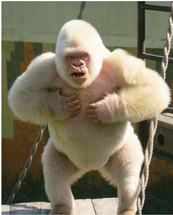
Figure 1 Snowflake , the only known albino gorilla. This Western lowland gorilla was wild-born in Equatorial Guinea and he presented the typical characteristics of oculocutaneous albinism.

phenotype (MIM 203200) (iii) mutations in TYRP1 cause OCA3 (MIM 203290) and (iv) OCA4 (MIM 606574) is caused by mutations in SLC45A2 (formerly known as MATP and AIM1 ) [3]. Tyrosinase and TYRP1 are critical in the melanin synthesis pathway whereas P protein ( OCA2 ) and SLC45A2 are involved in melanocytes maintenance or formation.