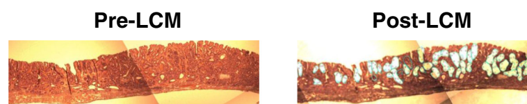
Fig. 1 Representative image of microdissected specimen. Tumor cells were obtained from ESD-resected specimens using laser capture microdissection (LCM). Left image (Pre-LCM) is before microdissection; right image is after microdissection (Post-LCM). Cyan circles indicate the cutting area

We examined 21 FFPE tumor samples collected from 20 patients (early stage, 19 patients; advanced stage, one patient) who had not previously undergone chemotherapy or radiotherapy. Matched peripheral blood lymphocytes were included as a control. Of the 21 FFPE tumor samples, 19 tumors had been resected by ESD and two by endoscopic biopsy. ESD-resected tumor tissue was dissected by laser capture microdissection with an average cutting area of 29.4 \text{ mm}^2 (range, 12.4\text{--}51.5 \text{ mm}^2 )