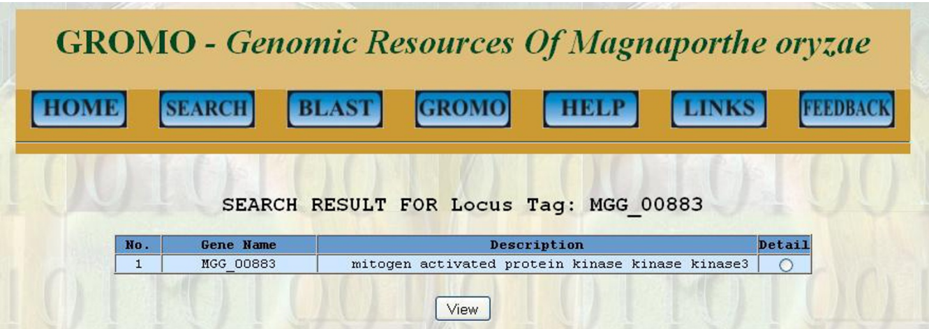
Figure 3 Screenshot of the query result page showing gene with specific locus tag and its description.