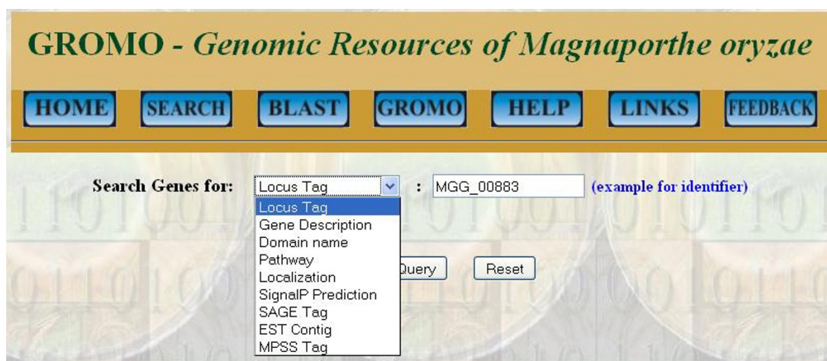
Figure 2 Screenshot of web interface showing various input options accepted by GROMO.

The queries provided by GROMO are focused on retrieving details available from various databases along with queried information for particular a gene or protein in M. oryzae . Currently, information about this fungus is dispersed in different resources at different locations. Among the existing databases, (i) BROAD MIT provides sequence information on M. oryzae genes and proteins with some information on protein domains; (ii) M. oryzae ATMT database provides information on some mutants and (iii)