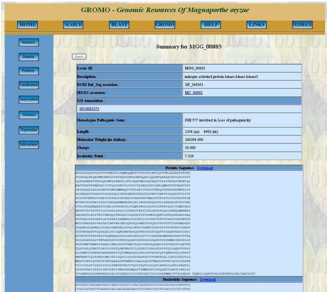
Figure 4 Screenshot presenting summary section of MGG_00883 along with links for other sections and web pages. It provides general information about the gene/protein describing its biochemical properties, accession number, annotations and sequences.