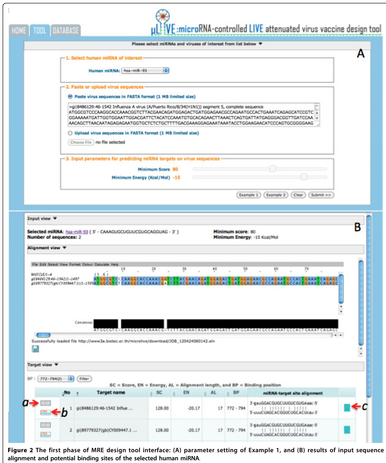
Figure 2 The first phase of MRE design tool interface: (A) parameter setting of Example 1, and (B) results of input sequence alignment and potential binding sites of the selected human miRNA.