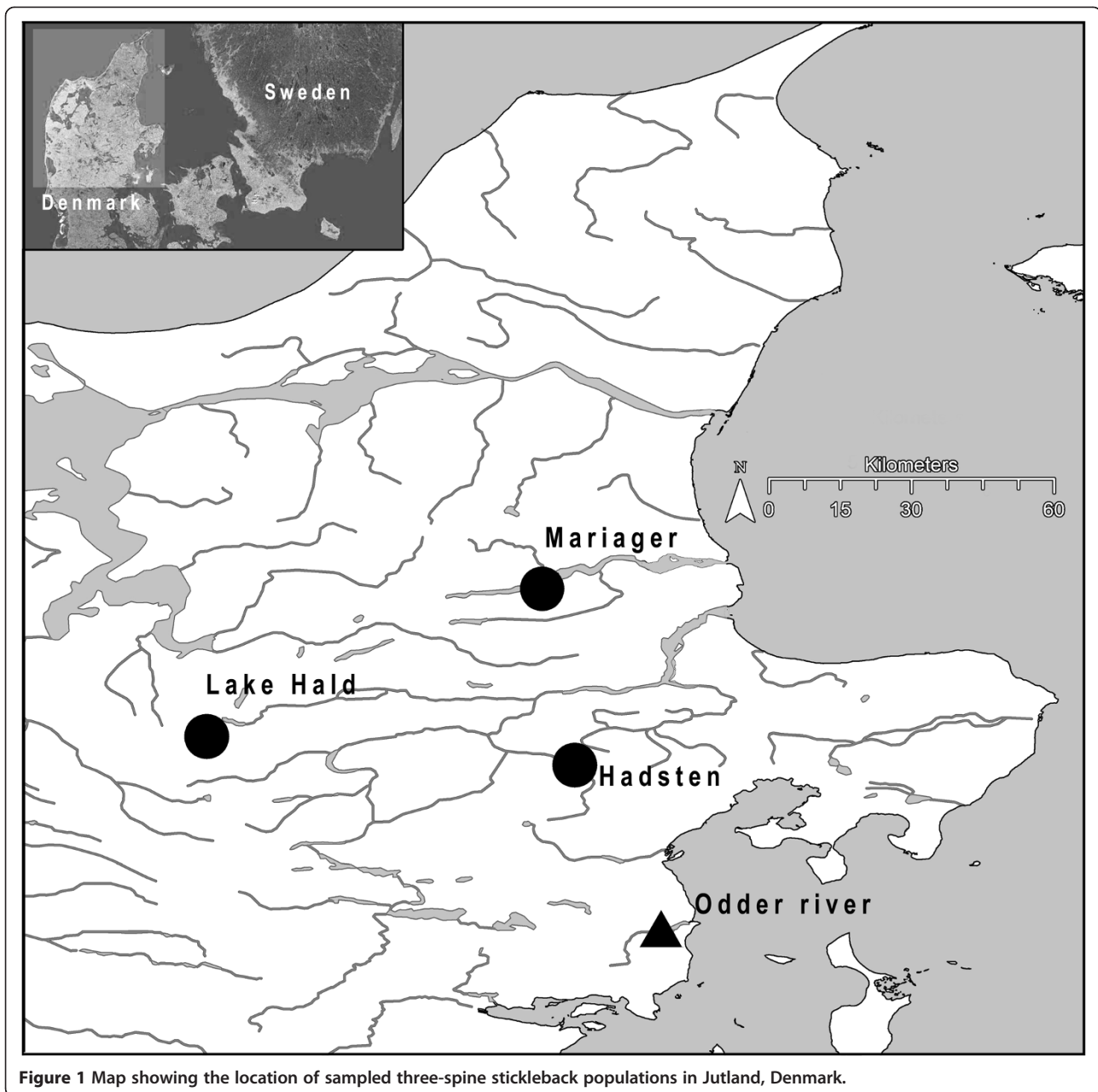
Figure 1 Map showing the location of sampled three-spine stickleback populations in Jutland, Denmark.

three alleles within individuals were also removed in order to avoid paralogs.