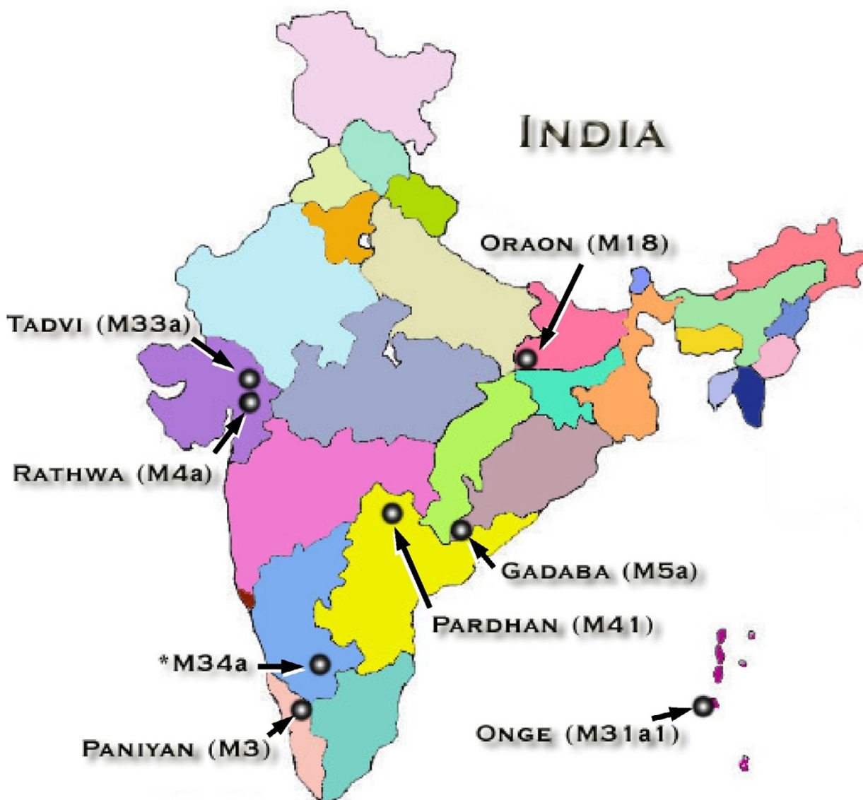
Figure 2 Geographical distribution of completely sequenced (mtDNA) samples used for the reconstruction of Indian M phylogeny. (*) Random sample from Karnataka state.

Moreover, our reanalysis of Andamanese-specific lineage M31 suggests population specific two clear-cut subclades. Onge and Jarwa share M31a1 branch while M31a2 clade is present only in Great Andamanese individuals [see Additional file 1].