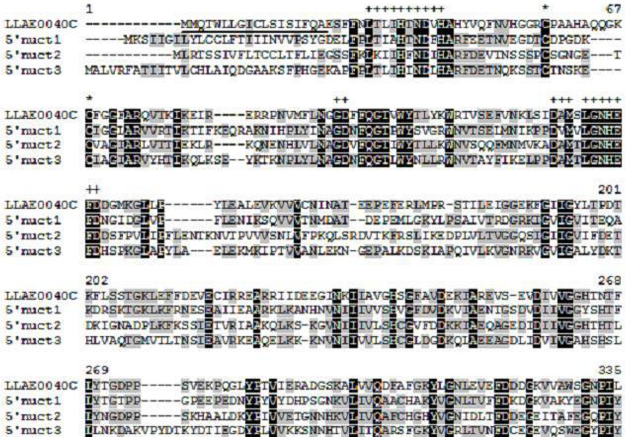
Figure 4 Alignment of the amino acid sequence of LLAE0040C, from L. laeta venom glands, with known 5'-nucleotidases. Residues are numbered according to the aligned 5'-nucleotidase sequences and dots represent gaps introduced to improve alignment. The underlined amino acid sequence indicates the putative signal peptide. The conserved cystein residues are indicated by asterisks. Black and gray indicate amino acids that are identical or conserved, respectively. The 5'-nucleotidases active site regions are indicate by crosses. The abbreviation and GenBank accession number for the 5'-nucleotidases sequences aligned are: 5'nuct1, Glossina morsitans morsitans 5'-nucleotidase (ABN80093); 5'nuct2, Aedes aegypti 5'-nucleotidase (ABF18486) and 5'nuct3, Anopheles gambiae 5'-nucleotidase (CAB40347).

'No hits' represents the biggest group of transcripts analysed in L. laeta cDNA library, accounting for 24.6% of total sequences, with 741 clones and 542 clusters (Figure 1 and Table 1). This result is not surprising, since there is a limited number of annotated Loxosceles spider nucleotide sequences currently deposited in the public databases. 320 transcripts (59%) of the 542 'non-hits' sequences contain putative signal peptide, as determined by using SignalP 3.0 program (data not shown). The search for conserved domains in databases (CDD) showed that most of the sequences have no function domains, except for a few that contain domains related to metabolism (data not shown).