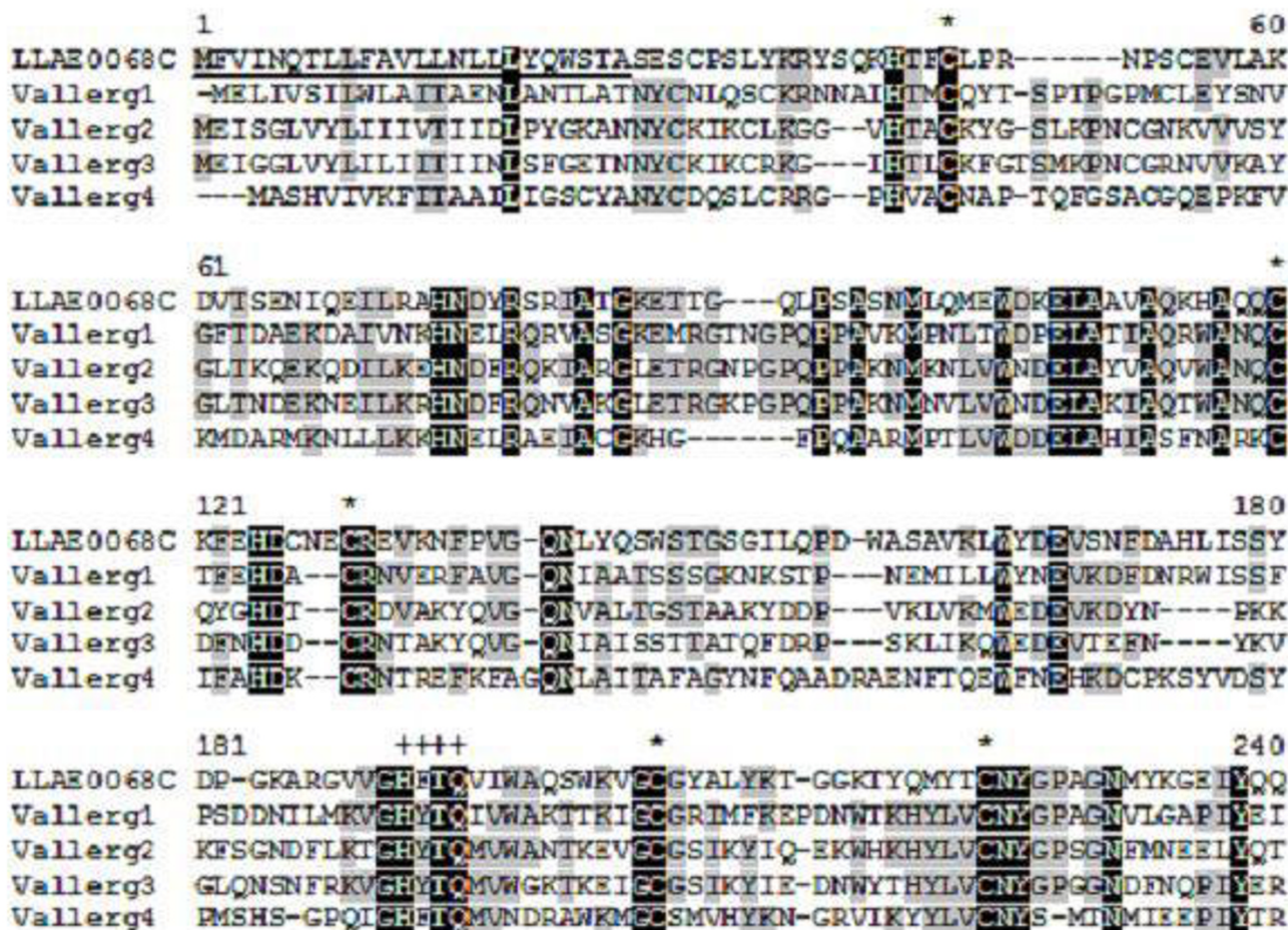
Figure 6 Alignment of the amino acid sequence of LLAE0068C, from L. laeta venom glands, with known sequences of venom allergen III. Residues are numbered according to the aligned of venom allergen III sequences and dots represent gaps introduced to improve alignment. The underlined indicates the putative signal peptide. The conserved cysteine residues are indicated by asterisks. Black and gray indicate amino acids that are identical or conserved, respectively. The conserved motif HYTQ (residues 192–195) is indicated by crosses. The abbreviation and GenBank accession number for the venom allergen III sequences aligned are: Vallerg1, Solenopsis invicta (P35778), Vallerg2, Vespula vulgaris (Q05110), Vallerg3 Dolichovespula maculata (P10736.1) and Vallerg4 Aedes aegypti (EAT48176).

Escherichia coli DH5α cells were transformed with the cDNA library plasmids and then plated on 2YT (Gibco-BRL Life Technologies) agarose plates containing 100 mg/mL ampicillin [14,46].