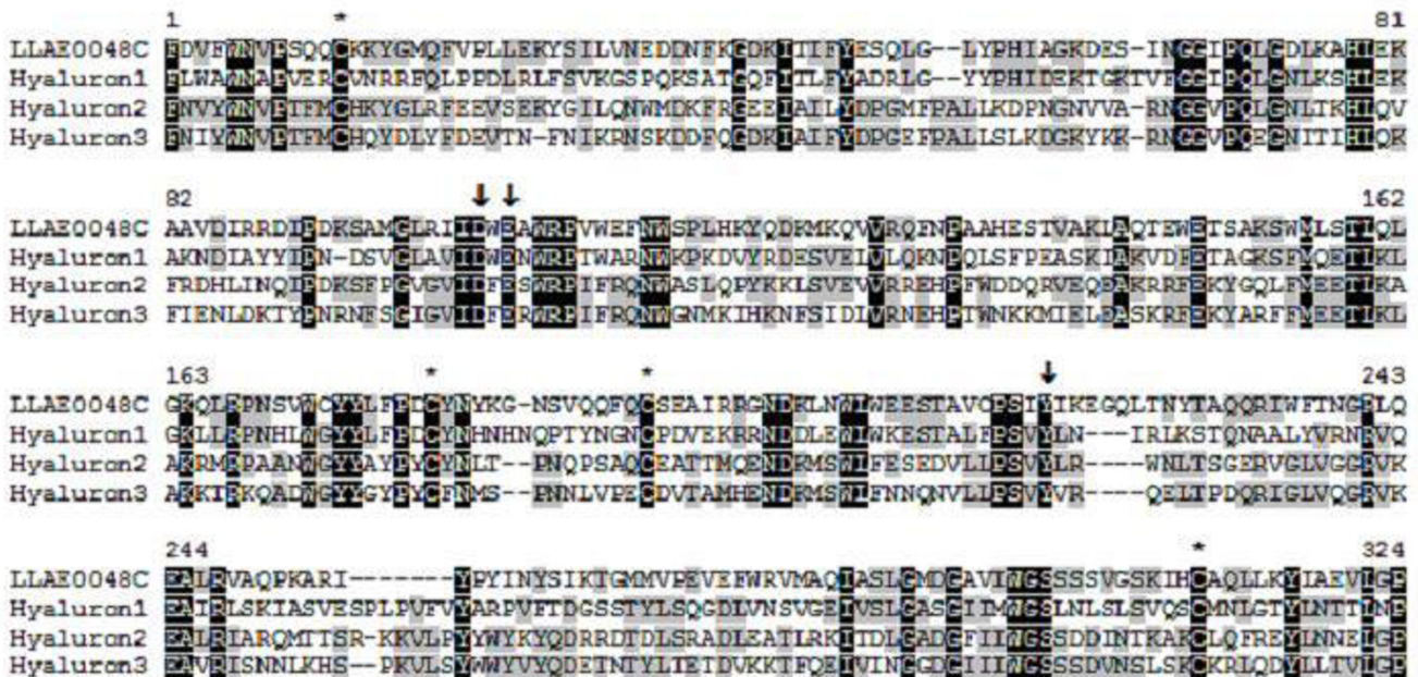
Figure 3 Alignment of the amino acid sequence of LLAE0048C, from L. laeta venom glands, with known hyaluronidases. Residues are numbered according to the aligned hyaluronidases sequences and dots represent gaps introduced to improve alignment. The conserved cystein residues are indicated by asterisks. Black and gray indicate amino acids that are identical or conserved, respectively. The three key catalytic residues are represented by arrows. The abbreviation and GenBank accession number for the hyaluronidases sequences aligned are: hyaluron1, Bos taurus hyaluronidase (AAP55713); hyaluron2, Apis mellifera hyaluronidase (AAA27730) and hyaluron3, Vespula germanica hyaluronidase (CAL59818).

The transcripts similar to 'venom allergen III' (sp|P35779|VA3_SOLRI) represent 0.6% of the total sequences (Figure 2D), with 18 clones and 2 clusters, as showed in group 16 (Table 1). The LLAE0068C (17 clones) and LLAE1344S matched with databases proteins from Solenopsis richteri and Solenopsis invicta insects, respectively. Venoms of Hymenoptera , including vespids, honey bees and fire ants are common causes of allergic reactions. Venom from the red fire ant, Solenopsis invicta ,