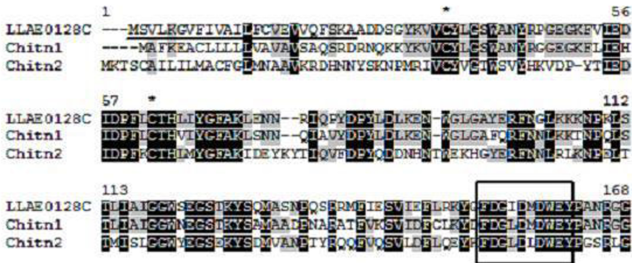
Figure 5 Alignment of the amino acid sequence of LLAE0128C, from L. laeta venom glands, with known chitinases. Residues are numbered according to the aligned chitinase sequences and dots represent gaps introduced to improve alignment. The underlined amino acid sequence indicates the putative signal peptide. The conserved cysteine residues are indicated by asterisks. Black and gray indicate amino acids that are identical or conserved, respectively. Chitinase glycosyl hydrolases family 18 active site signature is marked by a box. The abbreviation and GenBank accession number for the chitinase sequences aligned are: Chitin1, Araneus ventricosus chitinase (AY120879) and Chitin2, Dermatophagoides pteronyssinus chitinase (DQ078740).

The abundance of these transcripts, the failure of matching to known sequences and the presence of signal peptide suggest that may encode for novel toxins.